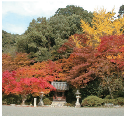
autumn maple leaves