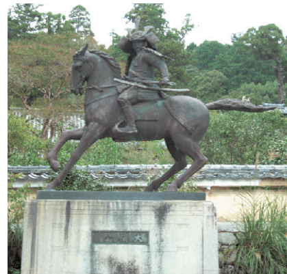
Kusunoki Masashige Statue