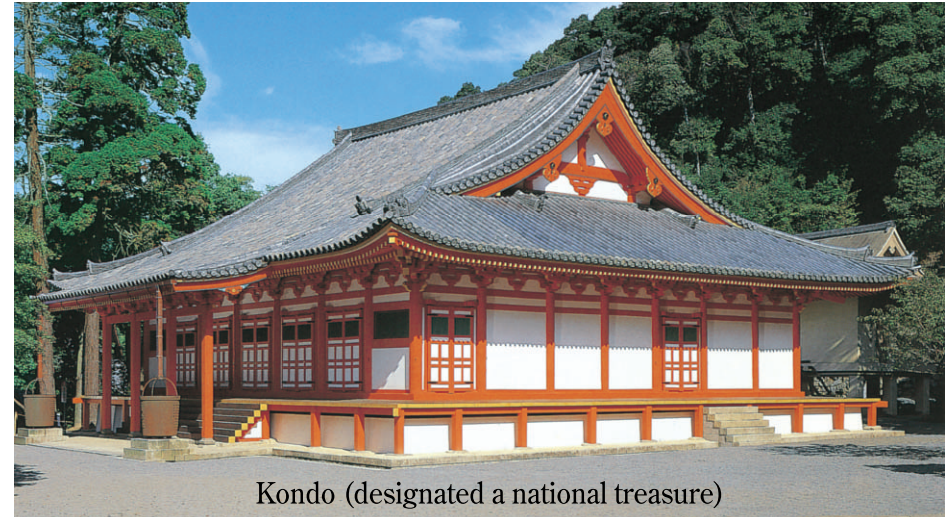
Kondo (designated a national treasure)

The temple was founded by the ascetic Enno-Gyoja in the 7th century and later in the 8th century restored by Kobo Daishi Kukai, the great master of Shingon Buddhism, and his disciples.