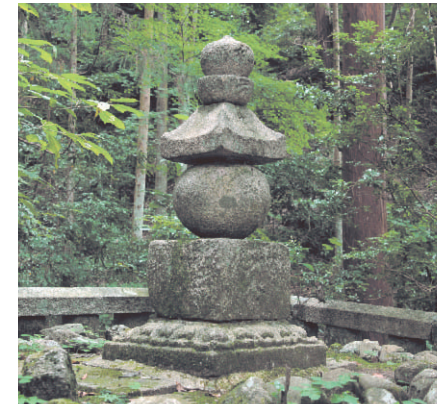
Kusunoki Masashige Kubi-zuka